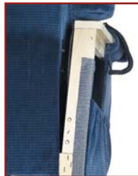
501 M shown