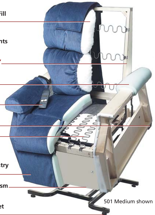
501 Medium shown

Adjustable Anti-Skid/Scrape Feet STABILITY & SUPPORT